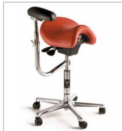
Fig. 4: The seat is available in different colors and versions. Therefore it fits into every treatment room.

Mary Gale, an Australian occupational therapist and inventor of the Bambach® Saddle Seat, researched the sitting position on horses, the fact that people with a wheelchair are able to sit on horseback without any support and why equestrians suffering from back problems are pain free once on horseback. You can learn more about her experiences from her book and leaflet about this seat. Please request free literature and appointment for demonstration at Hager & Werken's (www.hagerwerken.de). Legions of dental professionals and the general public cannot move without pain due to poor posture. Choosing the Bambach Saddle Seat will solve this problem. Make the smart choice. On a Bambach® Saddle Seat.