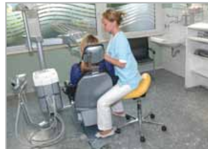
Fig. 1: The perfect posture with the Bambach® Saddle Seat.

Already in the sixties of the last century, when dentists still treated patients while standing, my father had a special seat fixed to his treatment unit due to a handicap. Already this seat was shaped like a saddle. My father never suffered from sloping shoulders. Some time ago, I received the Bambach® for testing and can now